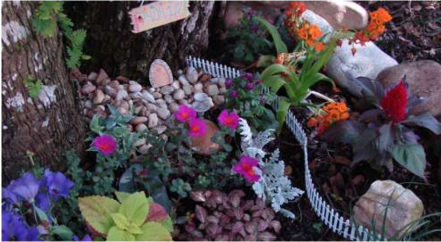
As a Mothers Day gift, Lisa Albright's family created this little Fairy Garden. Not sure which was more fun... the children's creative play or Lisa's smile every time she walked out the front door.

Engage with children of all ages in a natural play space for exercise and creativity in your own backyard.